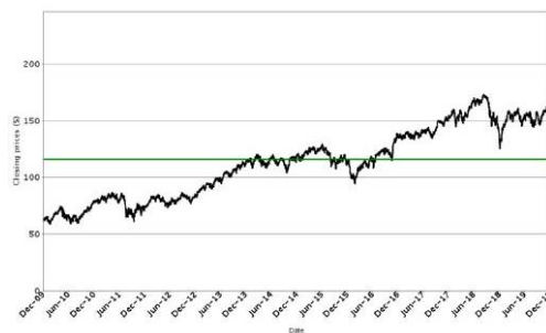
Coupon Barrier / Downside Threshold = 70% of its Initial Price