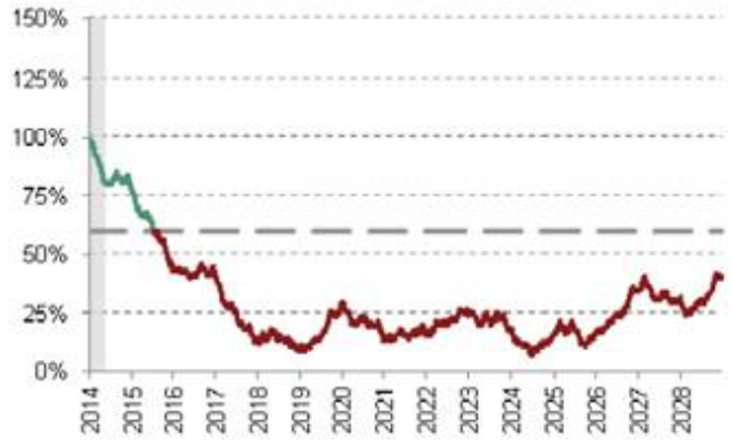
Underlier Level Generally Decreases Over the Life of the Notes, and the Final Underlier Level is Less Than the Trigger Buffer Level