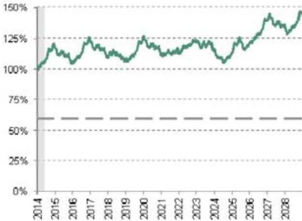
Underlier Level Generally Increases Over the Life of the Notes, and the Final Underlier Level is Greater Than the Trigger Buffer Level

■ Non-call Period — Above Underlier Barrier Level — Below Underlier Barrier Level