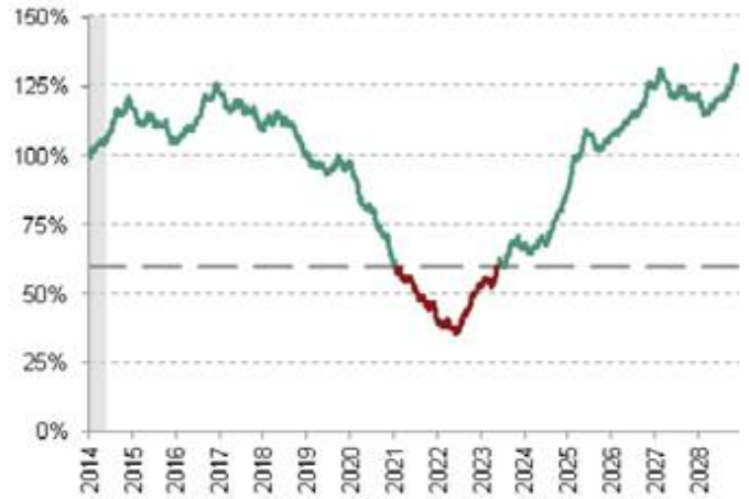
Underlier Level Increases and Decreases Over the Life of the Notes, but the Final Underlier Level is Greater Than the Trigger Buffer Level